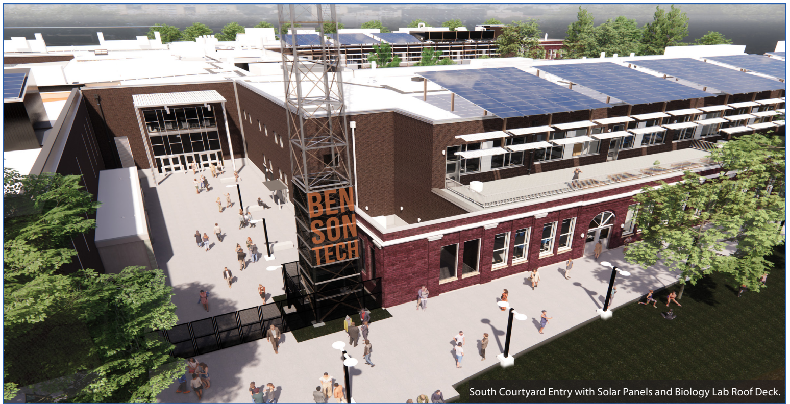
South Courtyard Entry with Solar Panels and Biology Lab Roof Deck.